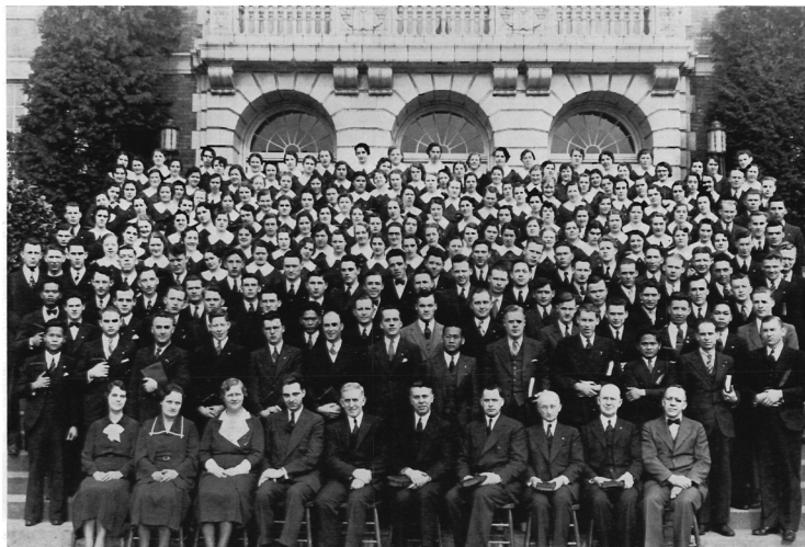
NORTHWEST BIBLE INSTITUTE FACULTY AND STUDENT BODY, 1936-37

Founded in Seattle by the Assemblies of God in 1934 as Northwest Bible Institute, the founding statement of purposes envisioned the current status of the school as a full-fledged institution of higher learning, offering academic and professional training at all degree levels across such fields as ministry, education, nursing, business, technology, and others. The school began offering degrees only in Bible, but in the 50th year of operation, added degrees outside the area of church ministry, and in the 75th year, launched the first doctoral program, the Doctor of Psychology degree.