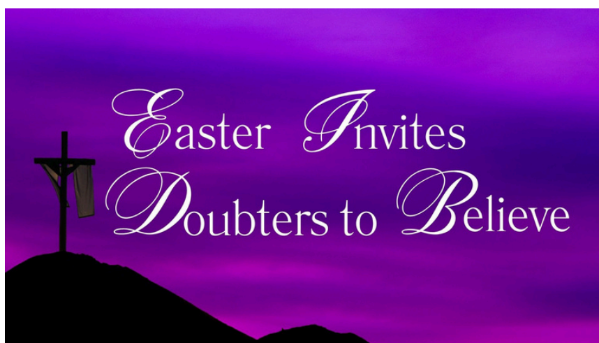
A taste of our weekend worship service