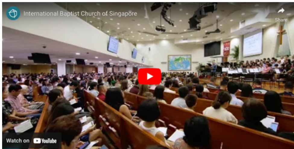
An overview of IBC as a local body of believers in Singapore

You may find out more about IBC and Singapore by watching the videos linked below.