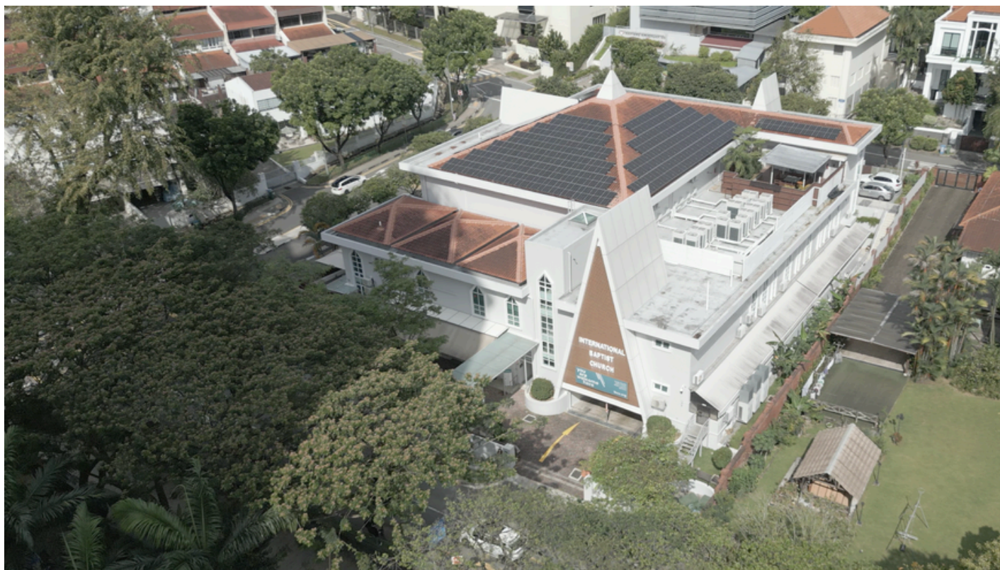
An aerial view of IBC showing the current building structure, and the surrounding community

From our humble beginnings in Holland Village, the Lord has guided more than 50 years to be a unique international body with over 50 nations represented. As His people, we first and foremost seek to honor and praise Him, and deeply trust Him for all that is to come.