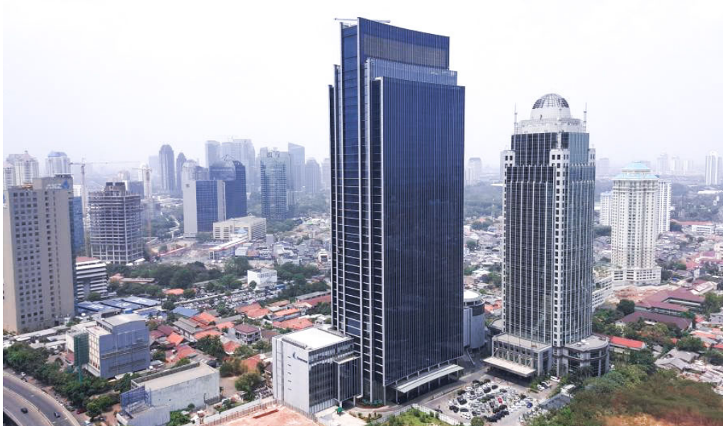
The City Center Batavia Tower One

In 2019 and 2020 we were able to purchase space in The City Center Batavia Tower One and under took renovations during this period while we maintained our ministry services online. Finally in 2022, as covid restrictions were being lifted, we were able to start restricted live services and in mid-2023 commenced full services in our new 600 seat auditorium with a very active Kid's Church and a Teen's Church that has already had to move into a new, larger space to accommodate growth.